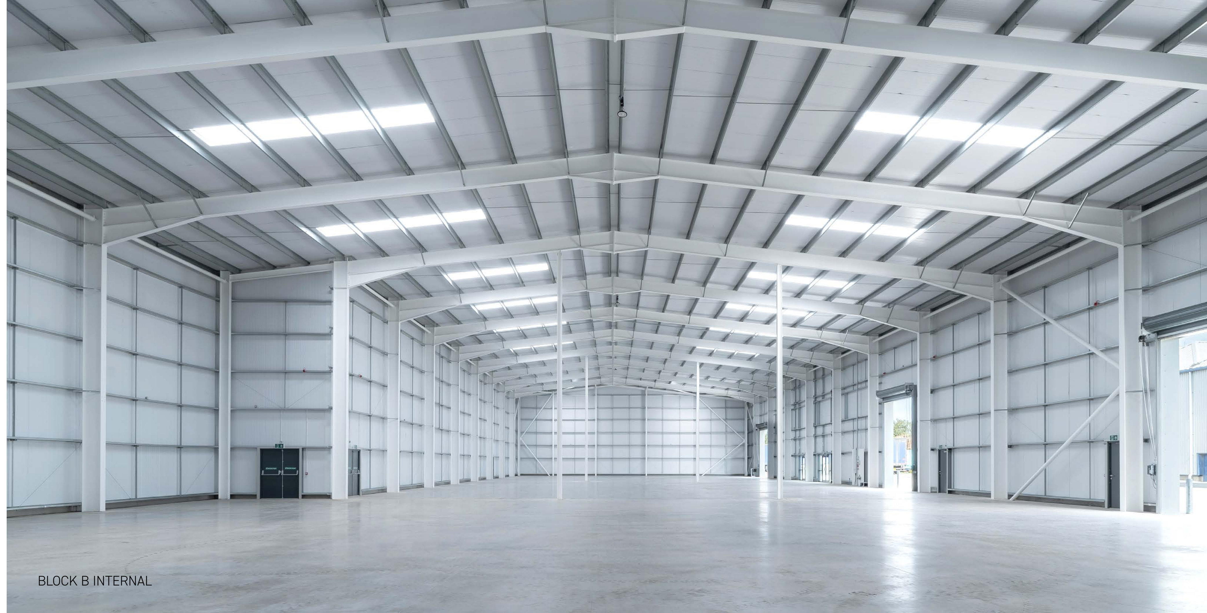
BLOCK B INTERNAL